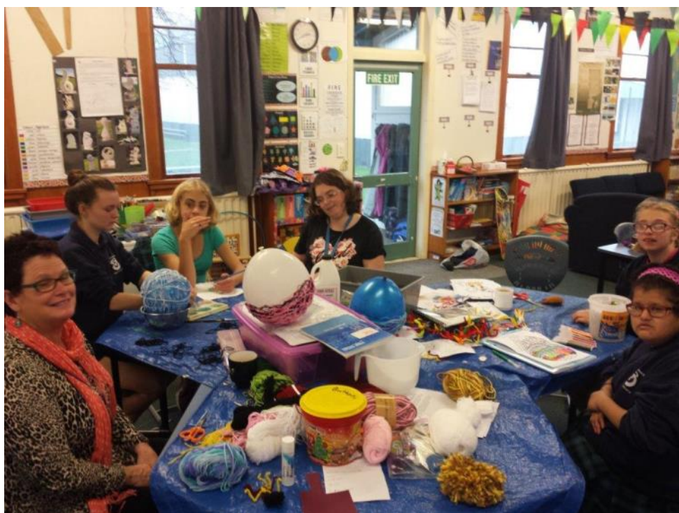
Craft afternoon working with wool and yarn.

The theme this term that we are focusing on is 'Change' and the Key Competency is 'Managing-Self'. Change is going on around us constantly and so this theme can be as diverse and complex as we make it. We have integrated it well into all curriculum areas to maximise learning with a main focus on 'Social Science' in the first two weeks then on 'Science' for the remainder of the term.