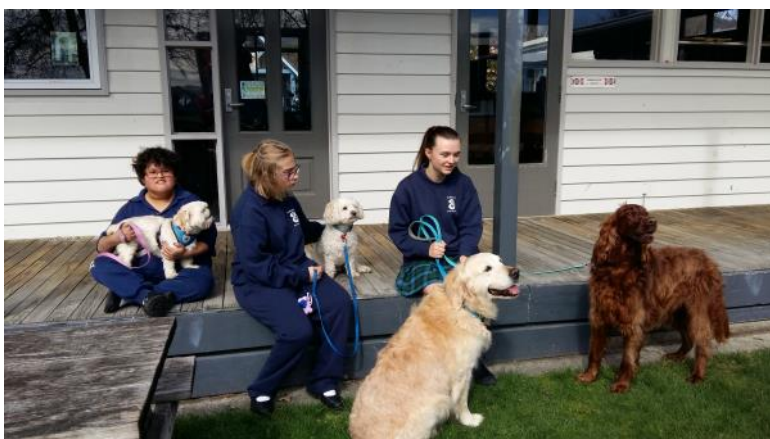
Competent dog handlers in Kimi Mātauranga